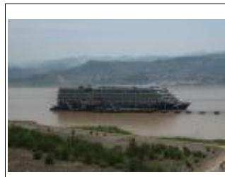
Victoria Cruise Lines China's American owned five star line