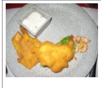
Five Star meal during Tang Dynasty Dinner Show

Today is another highlight of your tour, the Terra-cotta Warriors Museum . The thousands of life size soldiers and horses were created to guard the tomb of Qin Shi Huangdi, the first Emperor to unite China under his firm rule. The royal tomb itself has yet to be opened but the rank upon rank of Warriors is a sight that is unrivalled anywhere in the world. After lunch, visit the Forest of Stone Tablets museum , which is housed in the Temple of Confucius, has the largest collection of its kind in China with over 3,000 inscribed stone steles. Evening you will attend the deluxe Tang Dynasty Dinner Show at the famous Tang Dynasty Palace where fine food and spectacular entertainment await.