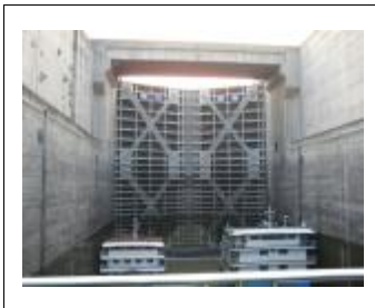
5 Stage Ship Lock

0630 Depart from Yichang/ Enter Xiling Gorge ( 66km ), pass the eastern section of this gorge. 0715 Breakfast. 0800-1030 Shore excursion to the 3 Gorges Dam . 1030 Briefing on Yangtze River. 1100 Pass the 5-stage ship locks of the 3 Gorges Dam ( 3.5 hrs ). 1200 Lunch. 1445 Pass the western section of the Xiling gorge. 1800 Dock at Badong. 1830 Captain's welcome cocktail party . 1900 Dinner. 2030 Fashion show .