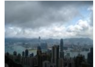
Hong Kong from Victoria Peak