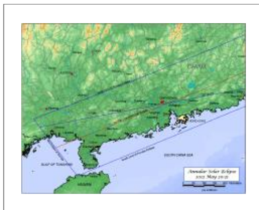
Path of Golden Ring at Sunrise

Tropical Sails Corp will provide safe viewing glasses, also known as Eclipse Shades® to our customers. We will have a limited amount of solar viewing film for cameras and binoculars. If you need larger quantities, see www.rainbowsymphony.com