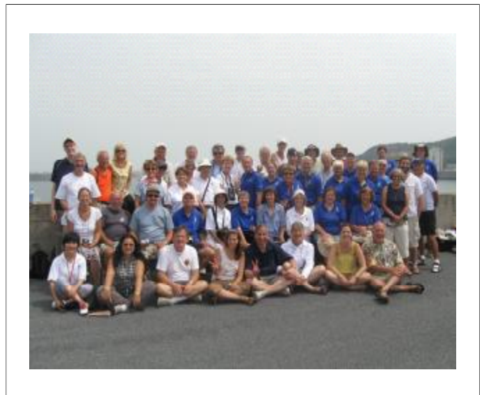
Happy Eclipse Chasers, Tianhuangpig reservoir near Anji, Zhejiang

Past customers suffered with the weather. A July and August solar eclipse led us deep into China at the wrong time